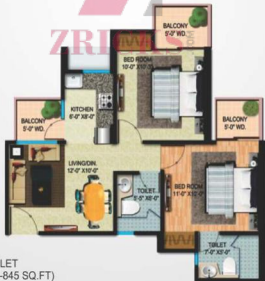
2 B.H.K. 2-TOILET (SUPER AREA-845 SQ.FT)