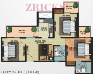
3 B.H.K. LOBBY, 2-TOILET ( TYPE-B) (SUPER AREA-995 SQ.FT)