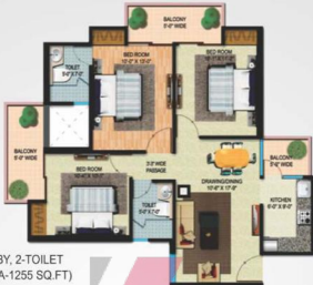
3 B.H.K. LOBBY, 2-TOILET (SUPER AREA-1255 SQ.FT)