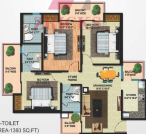
3 B.H.K., 3-TOILET (SUPER AREA-1360 SQ.FT)