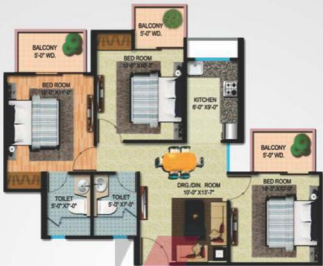
3 B.H.K. 2-TOILET ( TYPE-A) (SUPER AREA-995 SQ.FT)