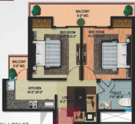
2 B.H.K. LOBBY, 1-TOILET (SUPER AREA-695 SQ.FT)